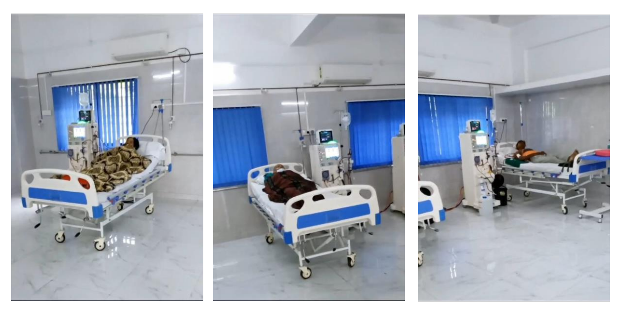
Three-bed Dialysis Unit at Ashakiran

Dialysis is a life-saving medical intervention for patients with kidney failure. Although government hospitals provide free dialysis services to those who are economically weak, the sheer number of patients can lead to long waiting periods. Delay in receiving dialysis could lead to rise in fluid, minerals and waste products in the body which are detrimental to the health of patients.